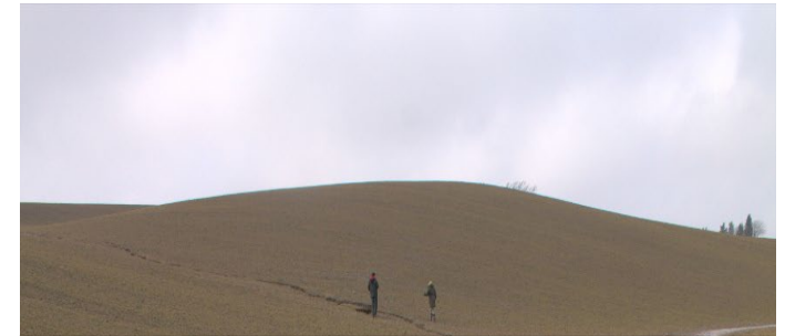
Photo by Lillian Øygarden, Field with erosion. Inga Greipsland, NIBIO; Norway (right).

Photos: Conservation measures in landscape in Czech Republic.