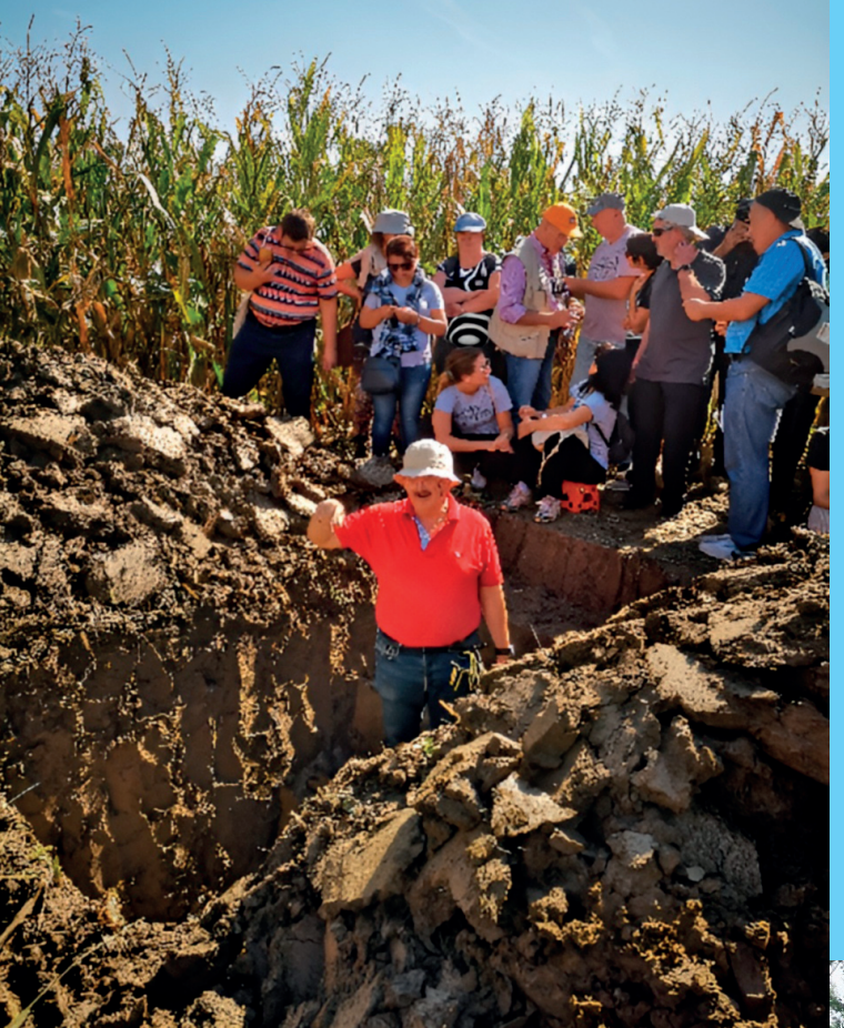
Field excursion during ESSC congress in Tirana, Albania.