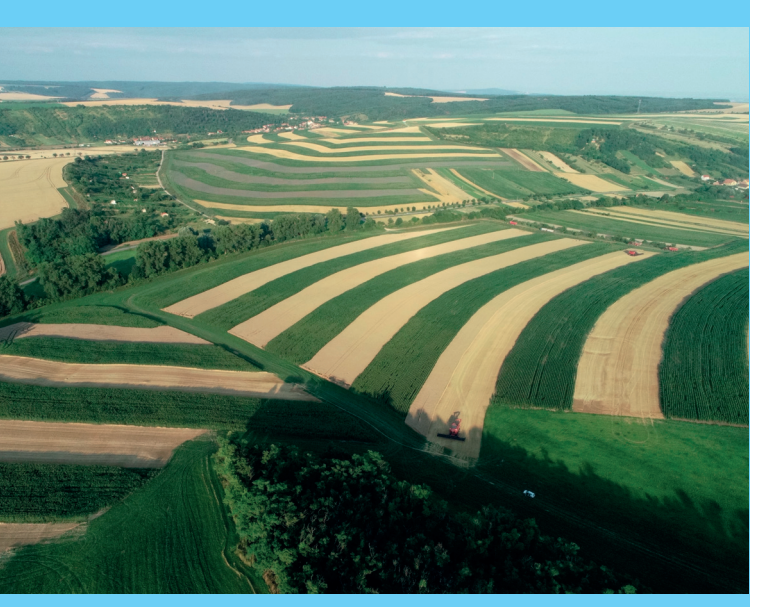
Conservation measures in landscape in Czech Republic.